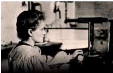
WOMEN IN PHYSICS