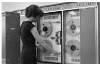
WOMEN IN COMPUTING

Discover Women in Science at the Science Museum . Women have long played an important but often unacknowledged role in science, technology, engineering, and mathematics. Explore the Science Museum's collection and discover engaging and inspiring examples of women's early participation in these innovative fields, from Ada Lovelace in the 1840s through to Beatrice Shilling's work in aviation during the Second World.