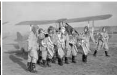
WOMEN IN ENGINEERING

Visit online at: https://www.sciencemuseum.org.uk/objects-and-stories/women-science