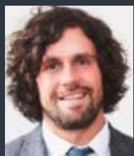
Head of School Primary