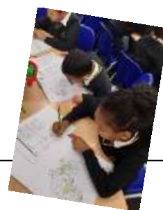
Head of School, Primary Phase Trinity all Through School

As always, I wish you the very best of weekends, full of rest and fun, ready for learning on Monday.