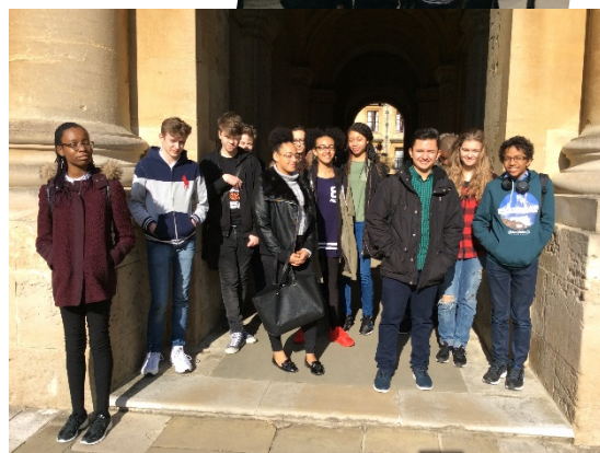
Trinity pupils on a trip to Oxford University

For more information on The Russell Group of universities and to view their Informed Choices booklet go to: