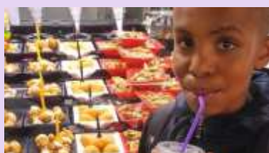
Enjoying treats on offer at La Bonqueria market

Enjoying the sunshine in Barcelona pupils explore the different culture and try out their Spanish.